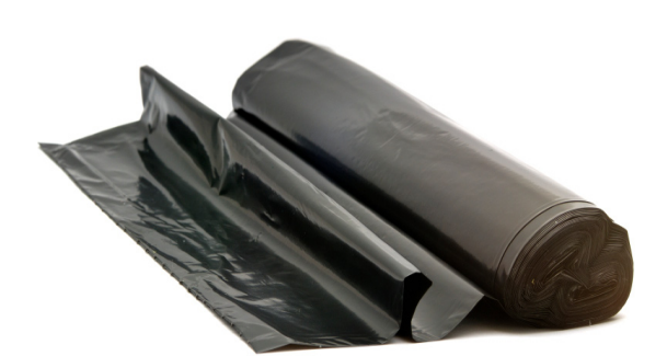
Generic ómil poly sheet, is commonly used in crawl spaces, but not as resilient as 20mil liners designed for this application.

Fiberglass soaks moisture like a sponge, and in contact with water it sags, also supporting mold growth on its paper facing.