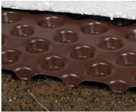
Drainage mats also provide a thermal break under the vapor barrier.