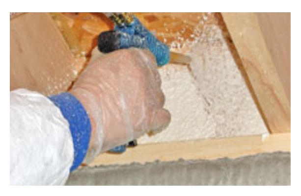
Closed Cell Spray Foam Insulation:

Although modern cellulose insulation is chemically treated to be mold resistant and handle moisture better than fiberglass it is still made with organic materials and there is not enough data to support that it can withstand chronic moisture conditions.