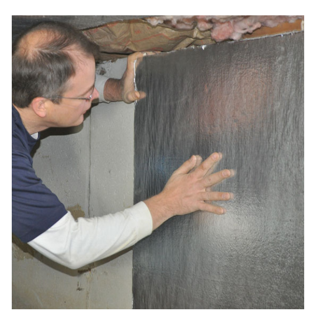
Newly developed, graphite-impregnated EPS boards, with a radiant barrier, like SilverGlo, by Basement Systems, have a higher R-Value than regular EPS. The graphite boosts the R-Value and the radiant barrier reflects heat back toward the living space.

For improved energy savings, a lower R-Value foam board, can be placed under the ground cover or in between the liner and the drainage mat.