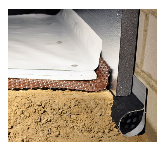
In this crawl space insulation assembly, performed by Basement Systems, the foam board insullation is attached to the wall. above the drain pipe, which is used iro improve drainage in wet crawlspaces. The drainage mat sits on the dirt floor, additional ioam board insulation is added over the mat for optimal energy savings and a vapor barrier is applied on top, overlaping the wall insulation.

encapsulation systems include a transparent cap instead of this protective membrane, to facilitate termite inspections.