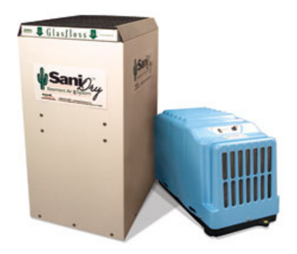
These two Energy-Star Rated SaniDry dehumidifiers, were developed specifically for crawl space and basement dehumidification, offering the best performance with lower energy consumption

An encapsulated and properly insulated crawl space can significantly decrease a home's energy consumption, protect its structural integrity and improve the lives of its inhabitants. Crawl space insulation is one of the home improvements that bring the best results and the most savings per each dollar invested.