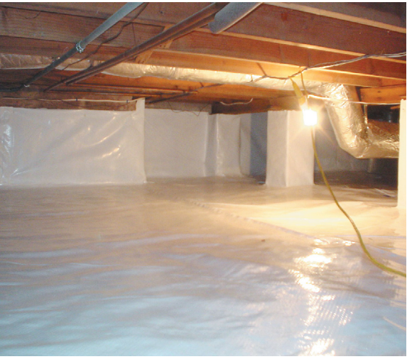
The entire crawlspace should be lined with vapor barrier, not just the floor.

In warmer areas, the entire space, including the walls, can be lined or encapsulated with a flexible poly sheet vapor barrier and, if the space is properly air sealed and conditioned, there will be no need to add insulation.